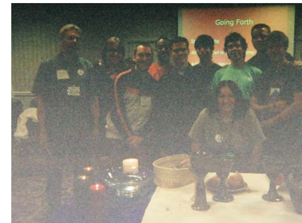
YYA at Gathering, 2007

The National Gathering this year was held prior to the General Synod in Hartford. We had fewer